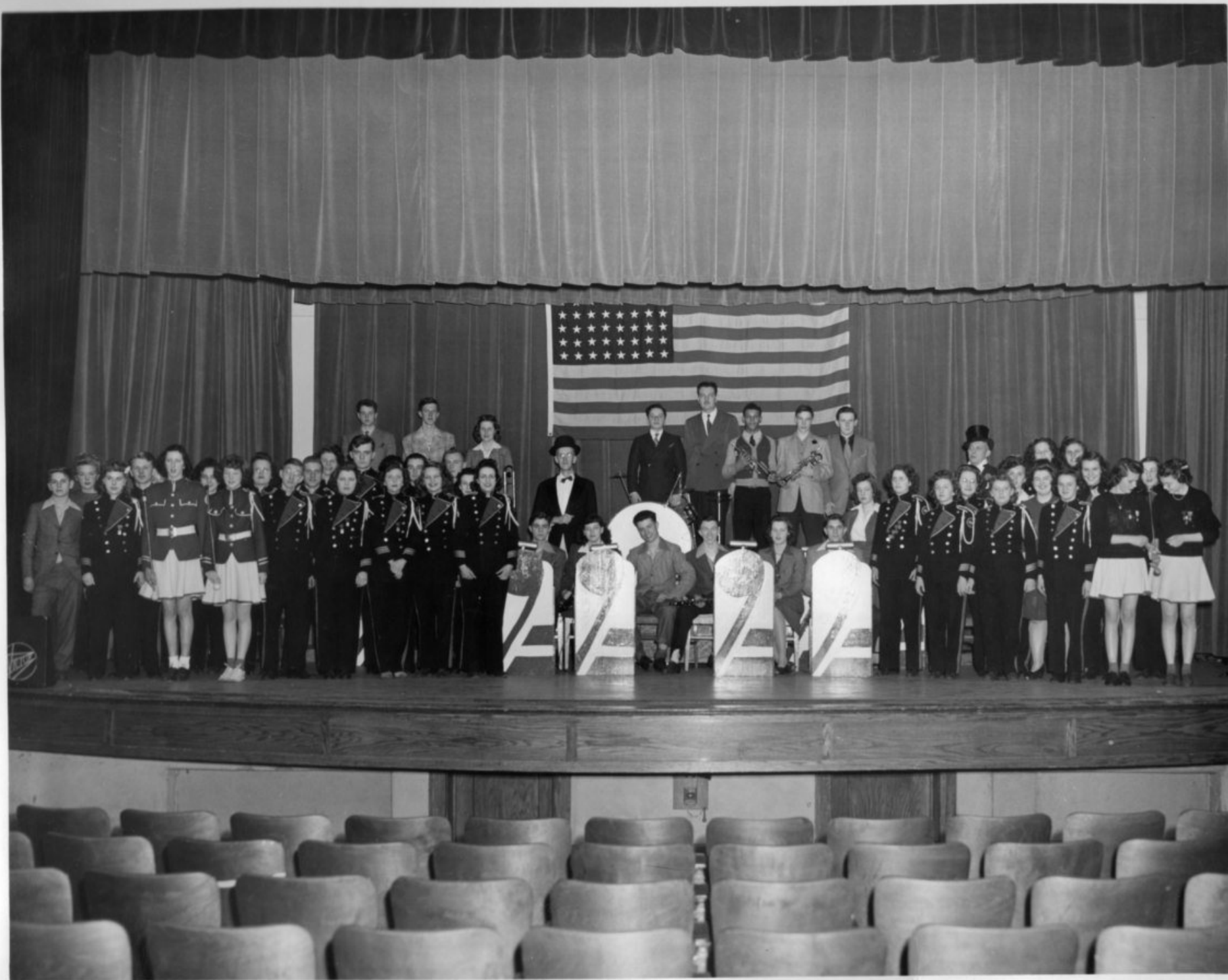
Possibly 1943 or 1944 - Paw Paw High School Band (Photo was not used in yearbook)