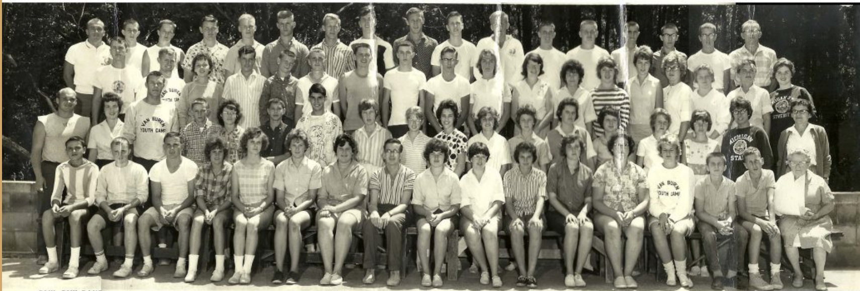
PAW PAW BAND