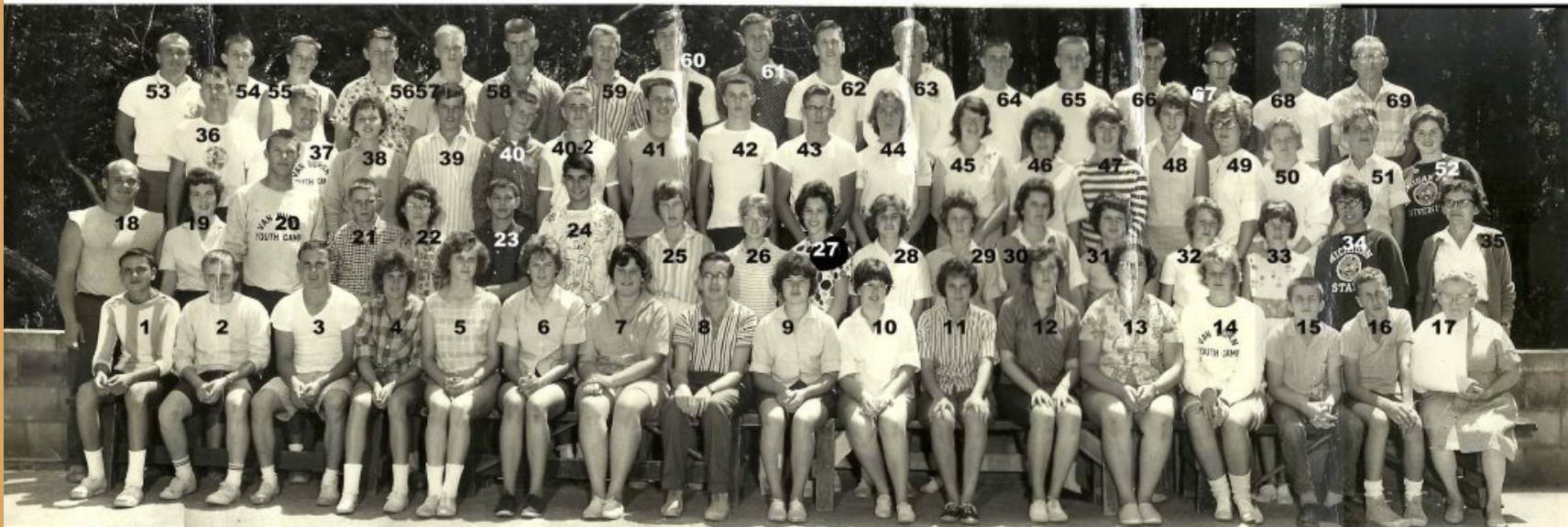
PAW PAW BAND